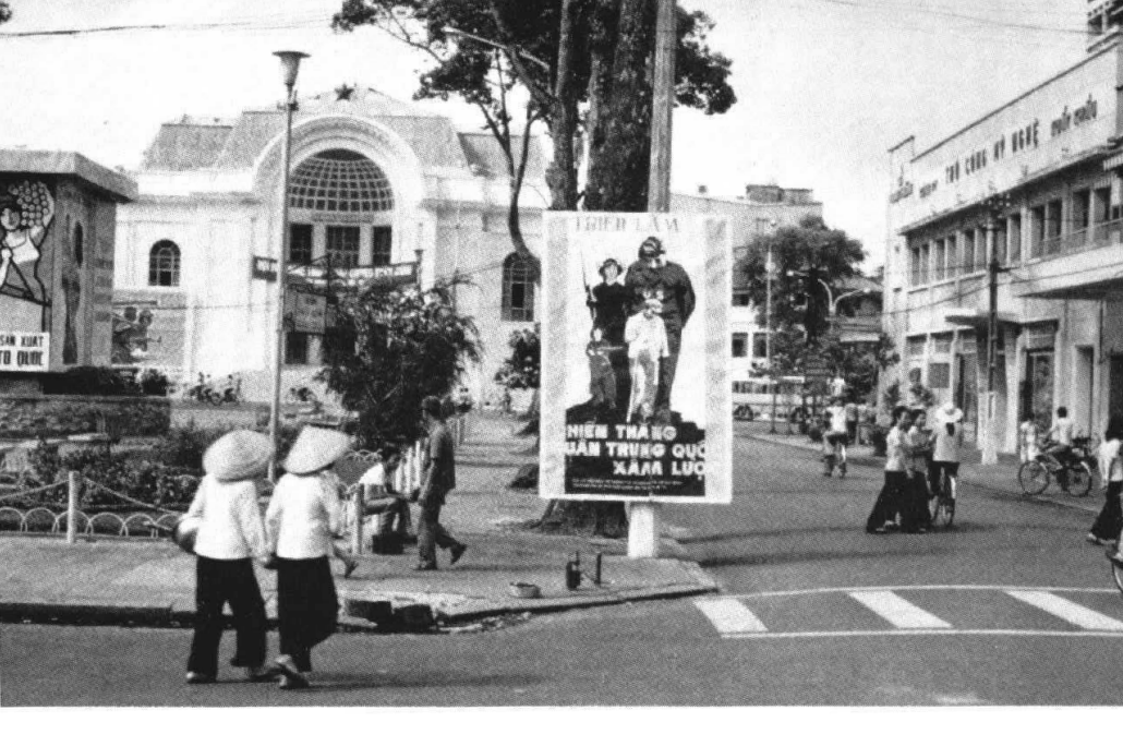
Ho Chi Minh City poster portrays American and Chinese "aggressors," 1979.

in 1967 as a regional, economic, cultural, and social cooperative organization. The original five member nations—Indonesia, Malaysia, the Philippines, Singapore, and Thailand (the sixth member, Brunei, was admitted in January 1984)—had little in common in their culture, history, or politics. Nevertheless, after a slow start the organization flourished; by 1987 it had the fastest growing GNP of all economic groups in the world and was a key force for regional stability.