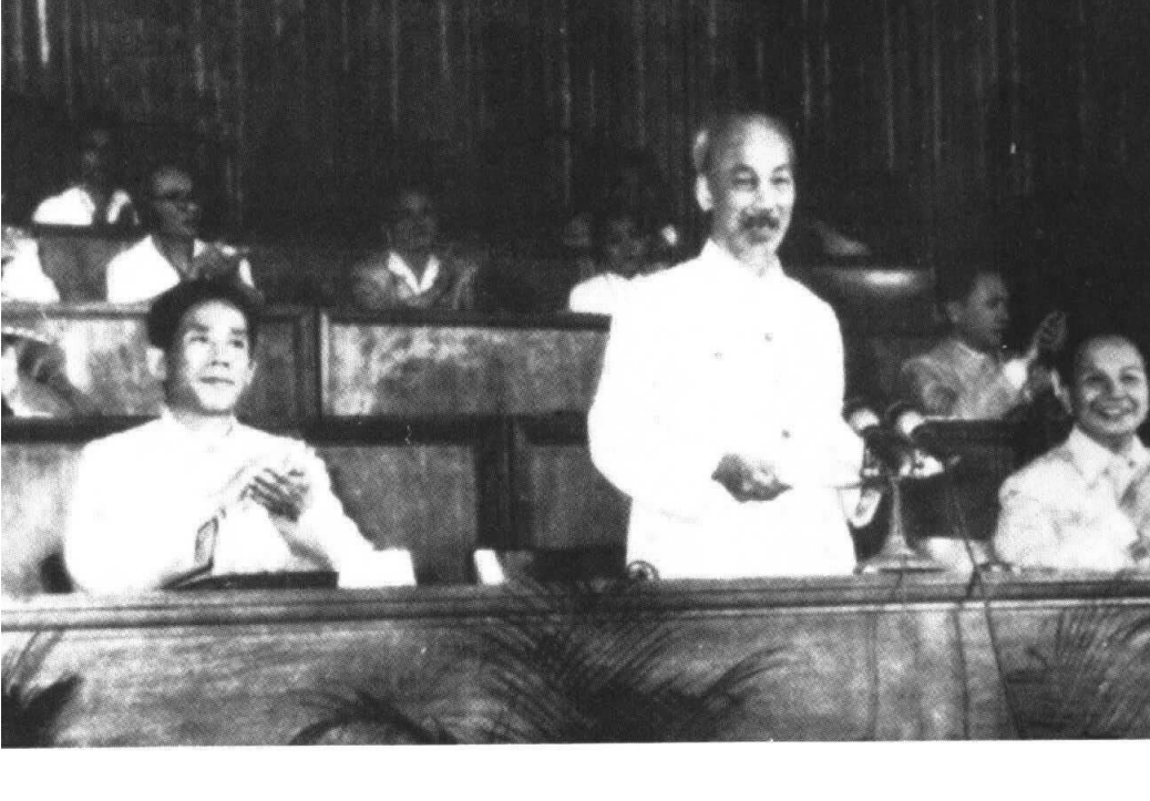
Ho Chi Minh addresses the Third National Party Congress (September 1960), flanked by Le Duan and Truong Chinh.

new alternate members. It expanded the Secretariat from ten members to thirteen, only three of whom had previously served.