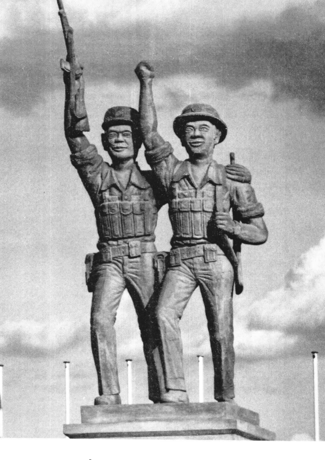
Statue representing Vietnamese and Cambodian solidarity, Prey Veng, Cambodia