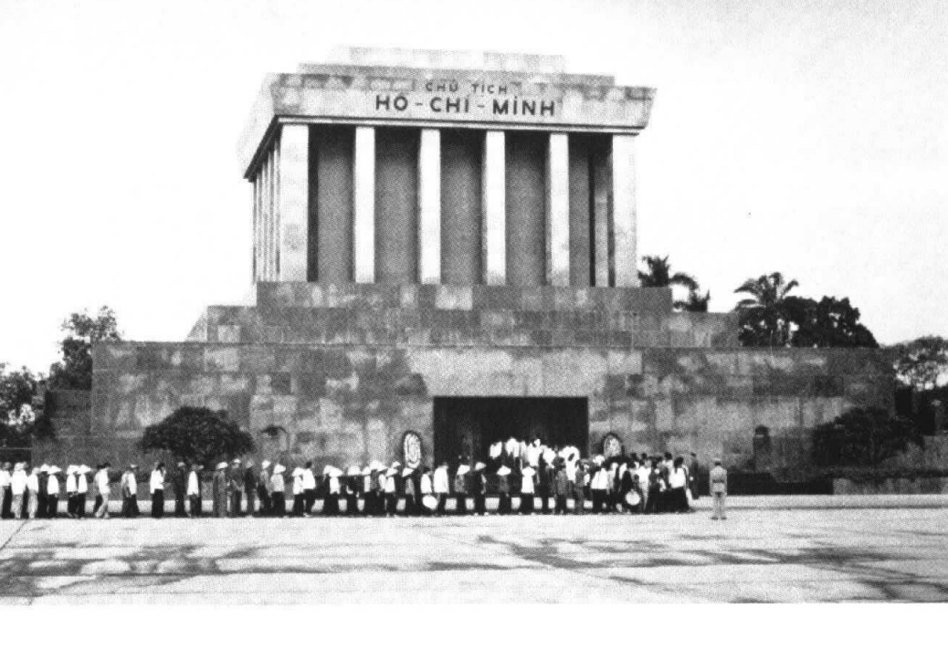
Ho Chi Minh's tomb in Hanoi

substituted for quality and resolved to stress quality in the future. In an effort to purify the party, growth over the next decade was deliberately checked. Membership in 1986 was close to 2 million, only about 3.3 percent of the population. According to Hanoi's estimates, nearly 10 percent, or 200,000 party members, were expelled for alleged inefficiency, corruption, or other failures between 1976 and 1986.