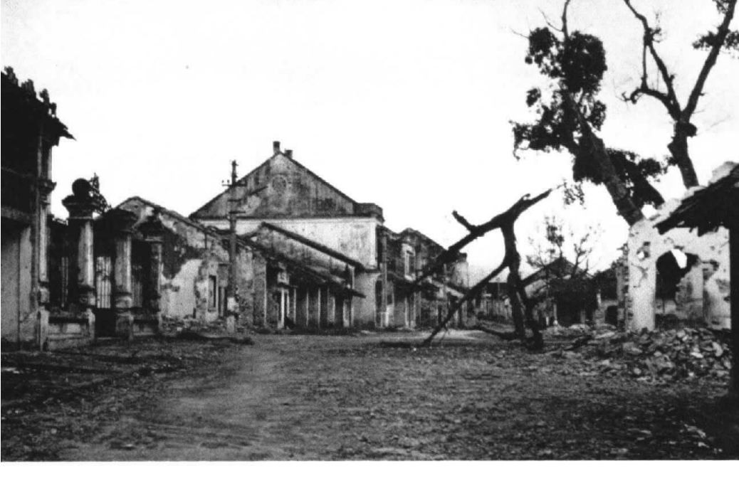
Lang Son following 1979 Chinese invasion

diplomatic activity in late 1986 indicated that Vietnam might mend its differences with China in the event the Soviets moved closer to the Chinese. Despite Hanoi's desire to ease tensions with Beijing, however, it was not willing to do so at the expense of its position in Cambodia.